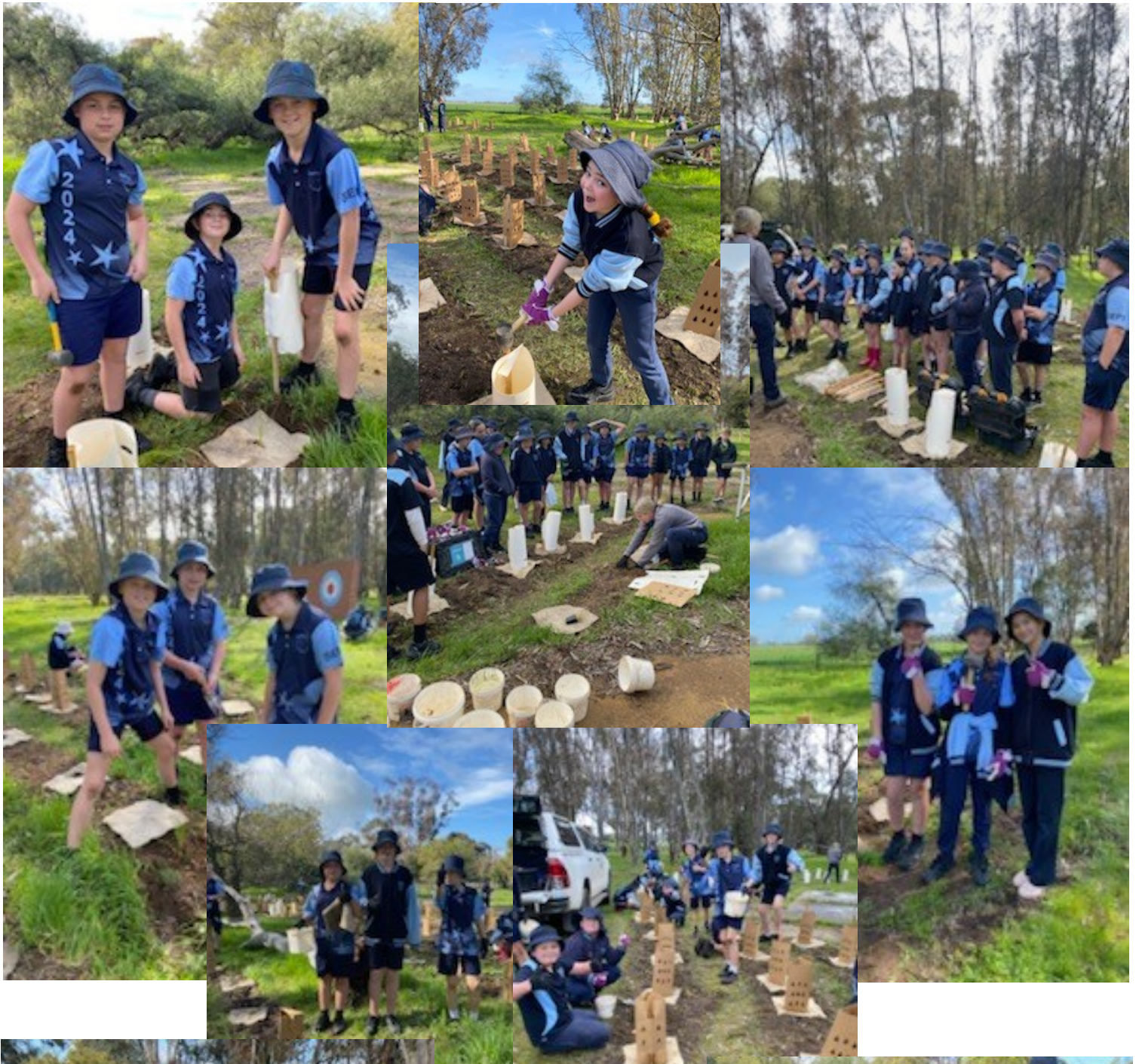
Our Yr 5/6 students enjoyed tree planting last week as part of the Greater Shepparton City Council's "One tree per child" program. The program aims to have every child plant a tree prior to leaving school.