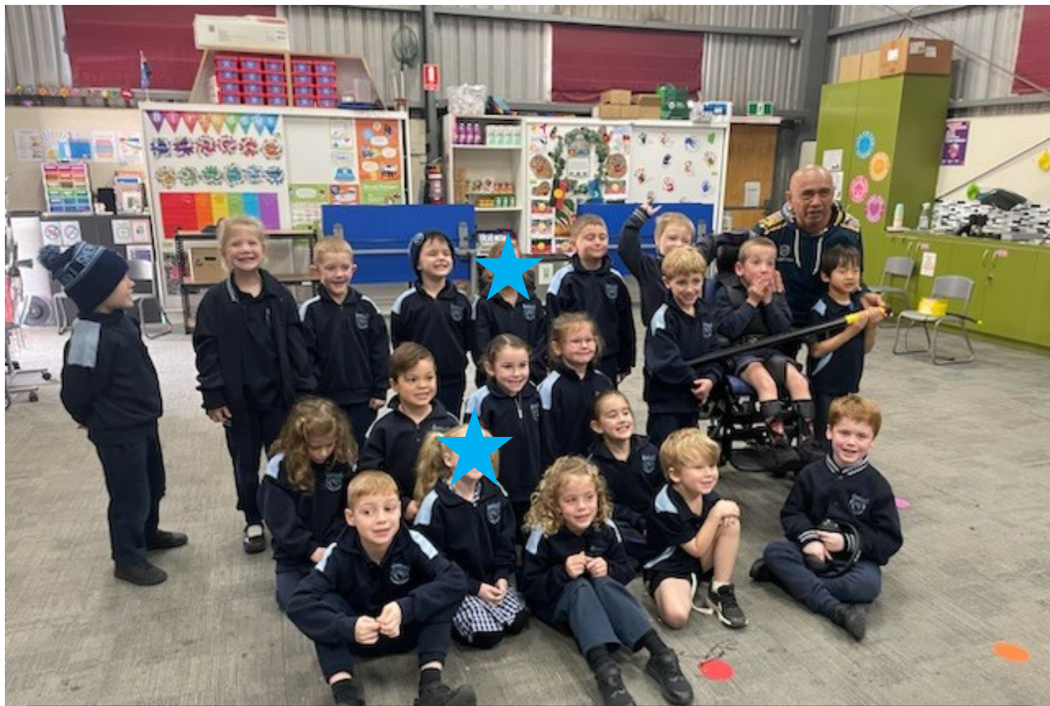
All our students enjoyed a Cultural Performance “Didgeribone” here at school on Monday. It was a unique and entertaining Australian music experience accompanied by both personal and ancestral stories.